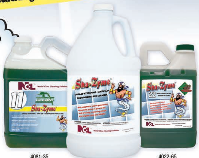
4081-35 4 x 1 gal case