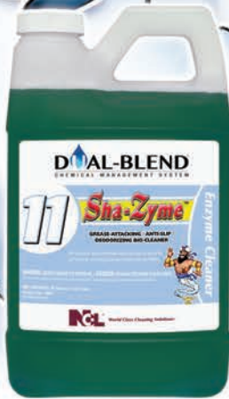
4081-24 4 x 80 oz case

Grease-Attacking / Anti-Slip Deodorizing Bio-Cleaner